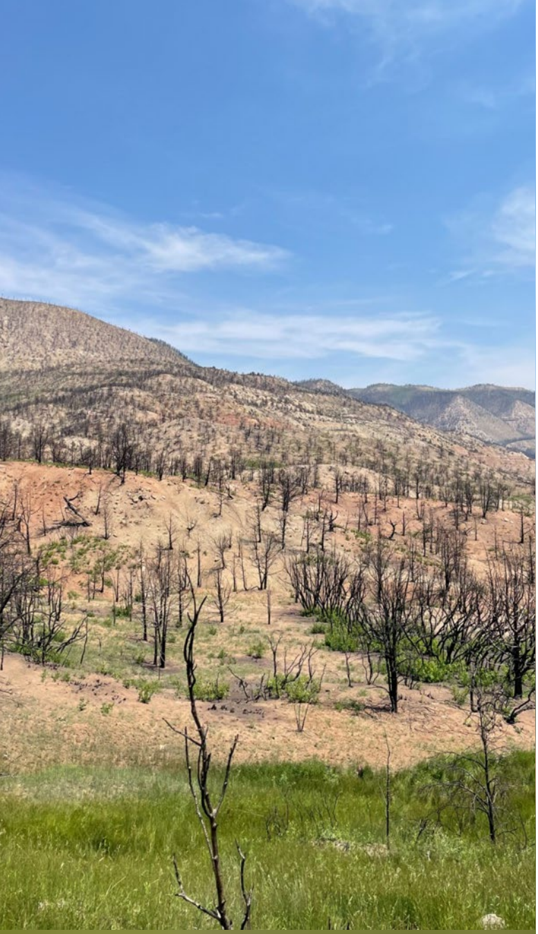
Pine Gulch Fire burn scar, Garfield County, CO.