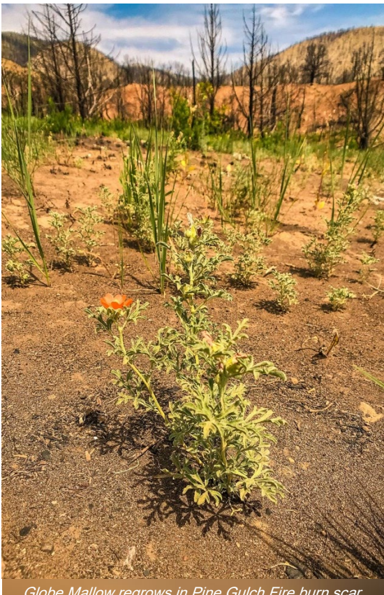
Globe Mallow regrows in Pine Gulch Fire burn scar.