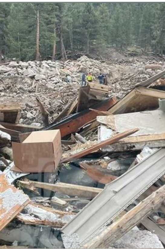
Post-fire flooding causes debris flow in the Cameron Peak Fire burn scar.