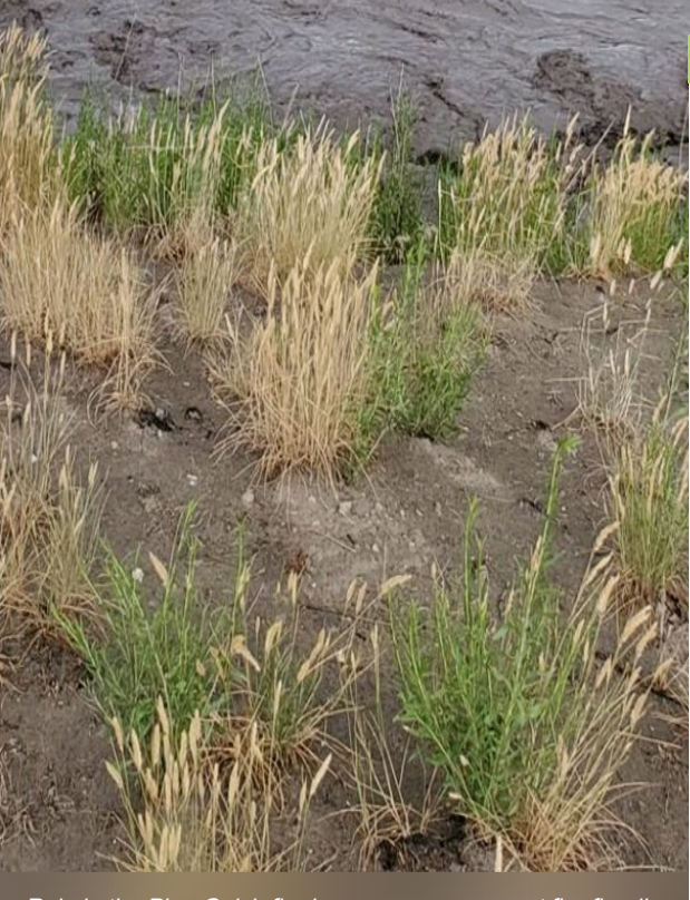
Rain in the Pine Gulch fire burn scar causes post-fire flooding.