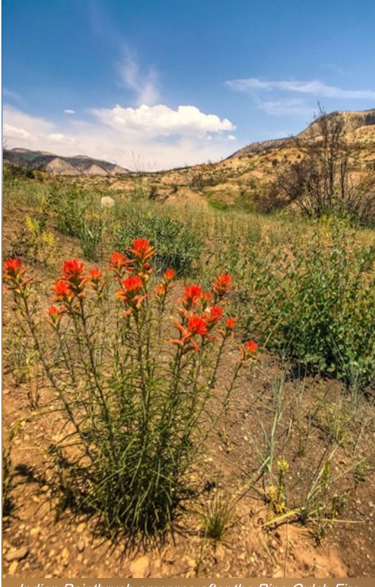
Indian Paintbrush emerges after the Pine Gulch Fire.